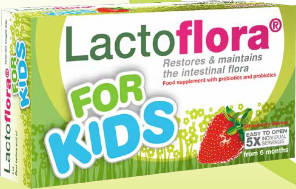
Strawberry flavour - from 6 months. Lactoflora intestinal protector - 5x7 ml vials.